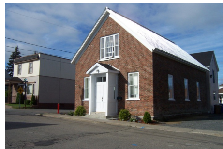
Église Baptiste Évangélique des Laurentides: BLF Canada's bookstore will be established in the basement.